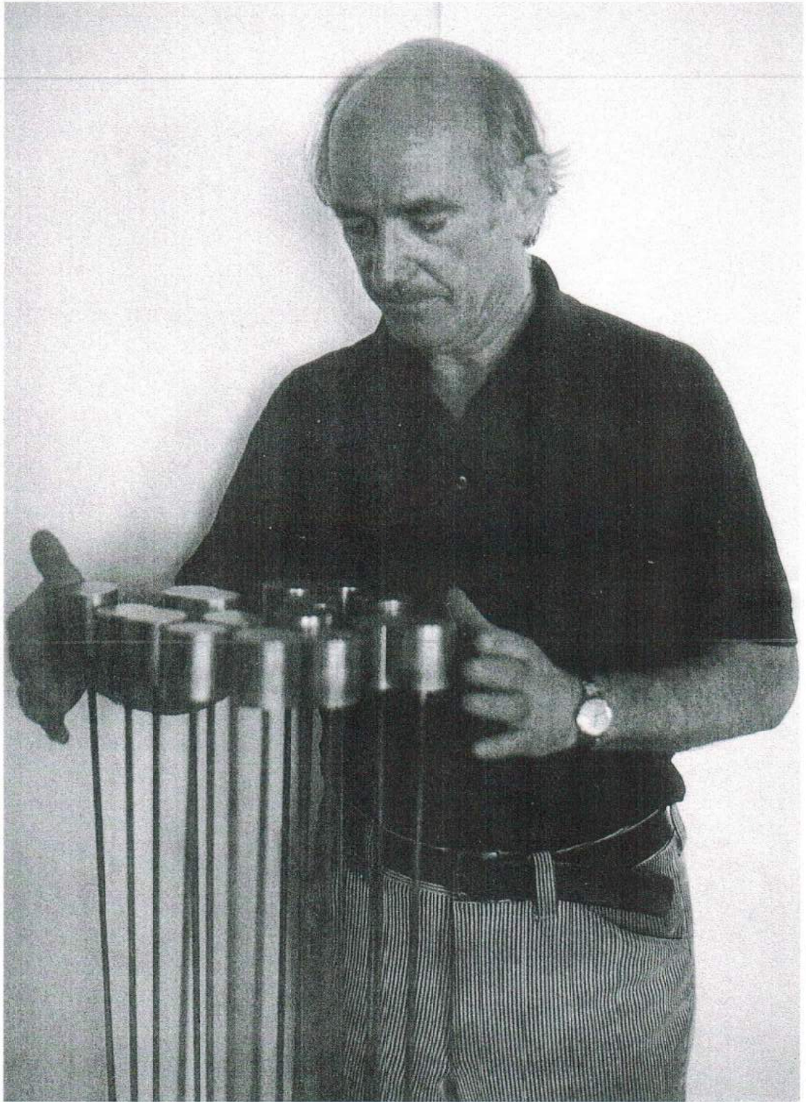
Harry Bertoia in his studio in July 1978.